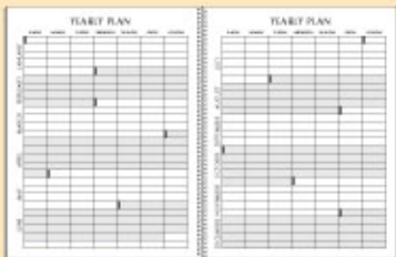
Year-In-View® Planning Calendar