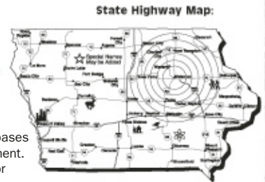
State Highway Map:

Note: Maps are based on databases developed by the U.S. Government.