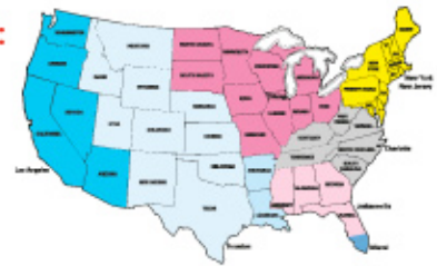
Spot Color Regional Map: